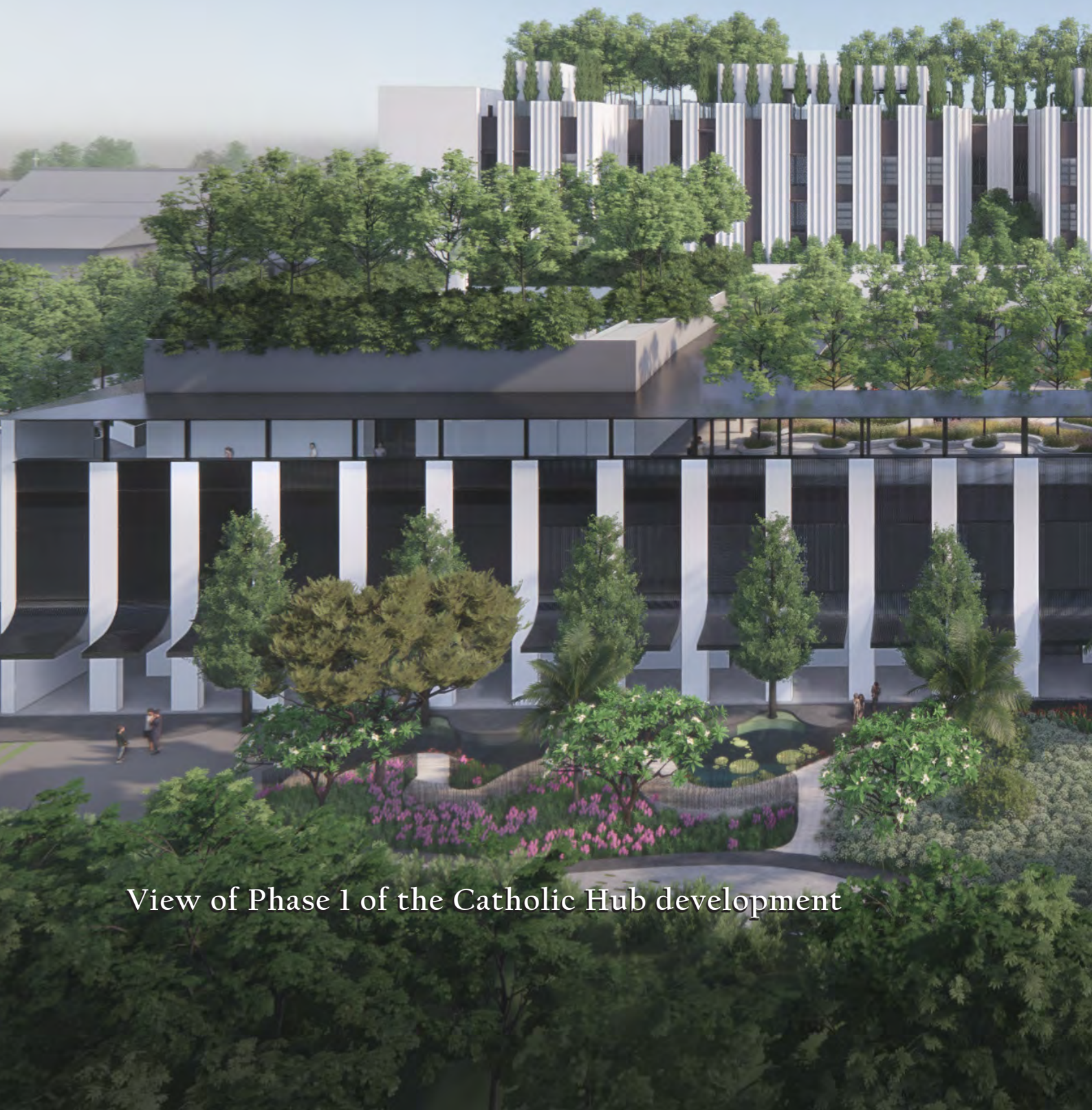
View of Phase 1 of the Catholic Hub development