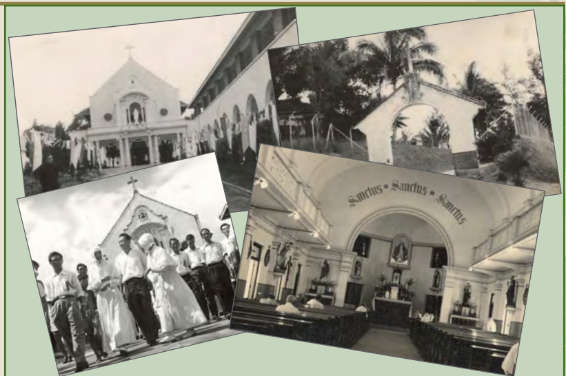
The Little Sisters of the Poor Home (today's St Theresa's Home under Catholic Welfare Services' purview) in the 1940s. Plans have been made to conserve various structures and buildings.

In recognising and preserving our past, the planned heritage centre can facilitate the faithful's collective memory of the love and sacrifice of our predecessors. This can galvanise us to live our faith more authentically and continue Christ's mission here in Singapore and around the world.